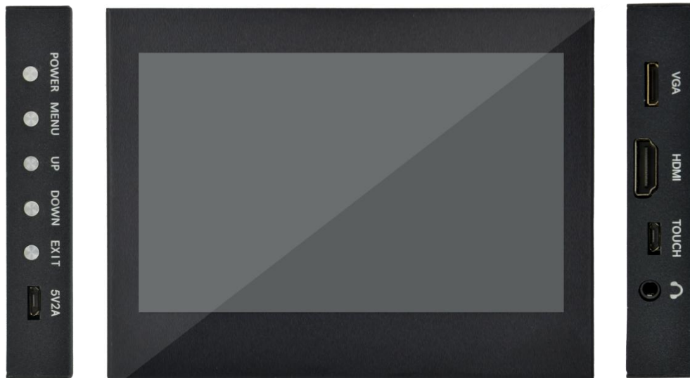
DEBIX TD050H-C (with enclosure)